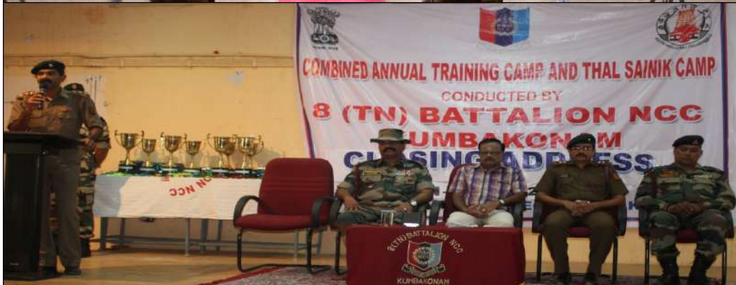
COMBINED ANNUAL TRAINING CAMP CUM THAL SHAINIK LAUNCH CAMP CONDUCTED @ GOVERNMENT ARTS COLLEGE (AUTONOMOUS), KUMABAKONAM