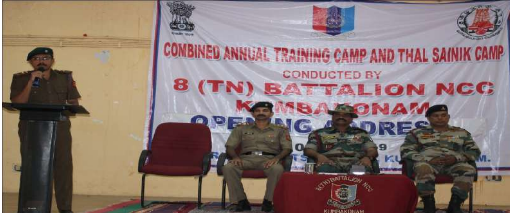
COMBINED ANNUAL TRAINING CAMP CUM THAL SHAINIK LAUNCH CAMP CONDUCTED @ GOVERNMENT ARTS COLLEGE (AUTONOMOUS), KUMABAKONAM