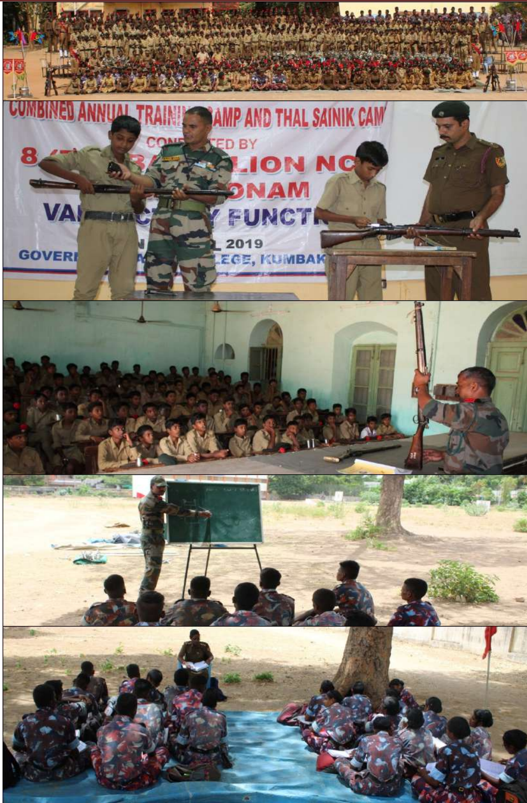
COMBINED ANNUAL TRAINING CAMP CUM THAL SHAINIK LAUNCH CAMP CONDUCTED @ GOVERNMENT ARTS COLLEGE (AUTONOMOUS), KUMABAKONAM