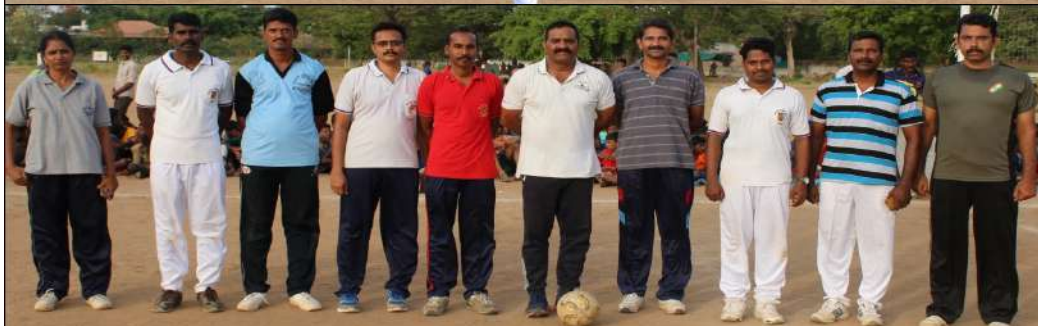
COMBINED ANNUAL TRAINING CAMP CUM THAL SHAINIK LAUNCH CAMP CONDUCTED @ GOVERNMENT ARTS COLLEGE (AUTONOMOUS), KUMABAKONAM