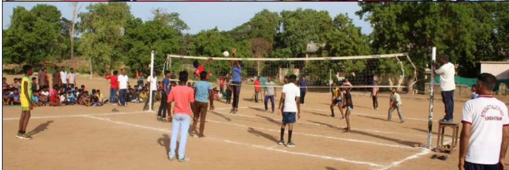
COMBINED ANNUAL TRAINING CAMP CUM THAL SHAINIK LAUNCH CAMP CONDUCTED @ GOVERNMENT ARTS COLLEGE (AUTONOMOUS), KUMABAKONAM