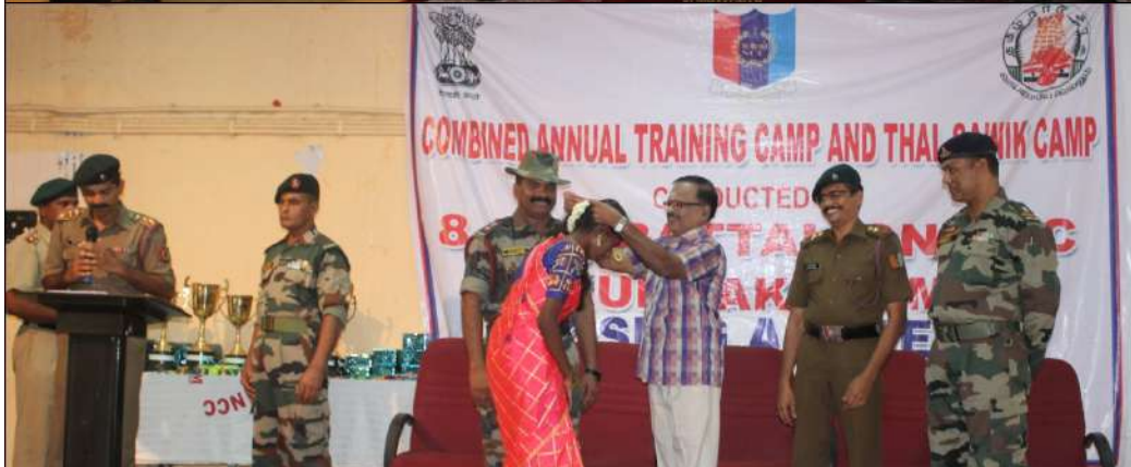
COMBINED ANNUAL TRAINING CAMP CUM THAL SHAINIK LAUNCH CAMP CONDUCTED @ GOVERNMENT ARTS COLLEGE (AUTONOMOUS), KUMBABAKONAM