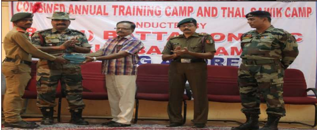
COMBINED ANNUAL TRAINING CAMP CUM THAL SHAINIK LAUNCH CAMP CONDUCTED @ GOVERNMENT ARTS COLLEGE (AUTONOMOUS), KUMABAKONAM