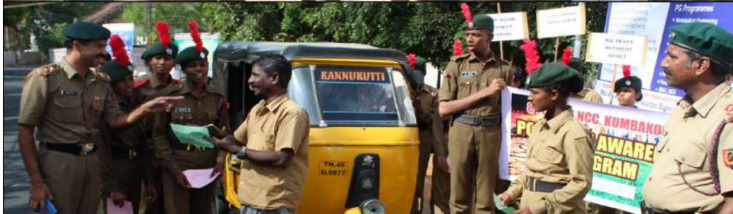
COMBINED ANNUAL TRAINING CAMP CUM THAL SHAINIK LAUNCH CAMP CONDUCTED @ GOVERNMENT ARTS COLLEGE (AUTONOMOUS), KUMABAKONAM