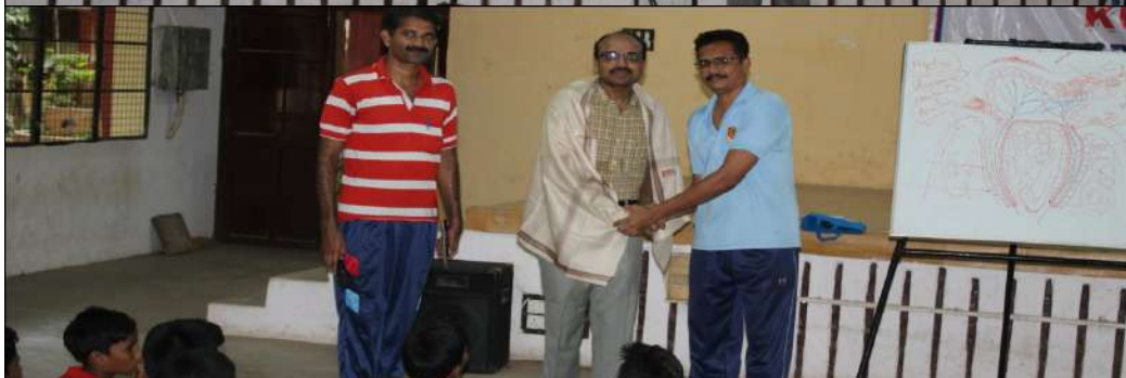
COMBINED ANNUAL TRAINING CAMP CUM THAL SHAINIK LAUNCH CAMP CONDUCTED @ GOVERNMENT ARTS COLLEGE (AUTONOMOUS), KUMBABAKONAM